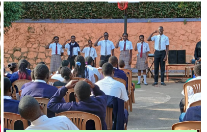
NTINDA JOINT DEVOTION