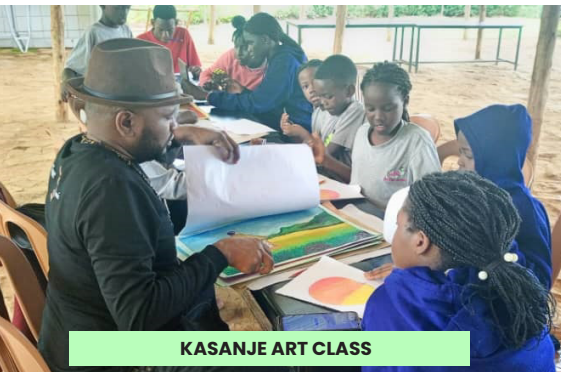
KASANJE ART CLASS