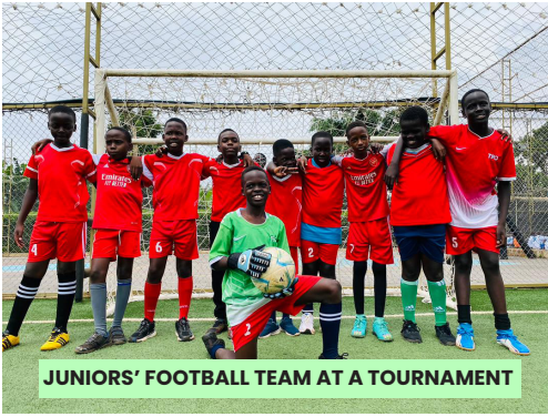
JUNIORS' FOOTBALL TEAM AT A TOURNAMENT