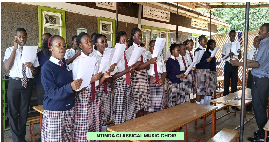
NTINDA CLASSICAL MUSIC CHOIR