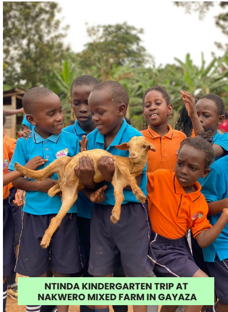
NTINDA KINDERGARTEN TRIP AT NAKWERO MIXED FARM IN GAYAZA