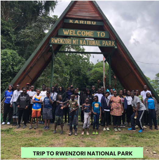
TRIP TO RWENZORI NATIONAL PARK