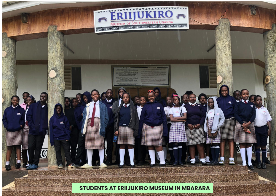
STUDENTS AT ERIJUKIRO MUSEUM IN MBARARA