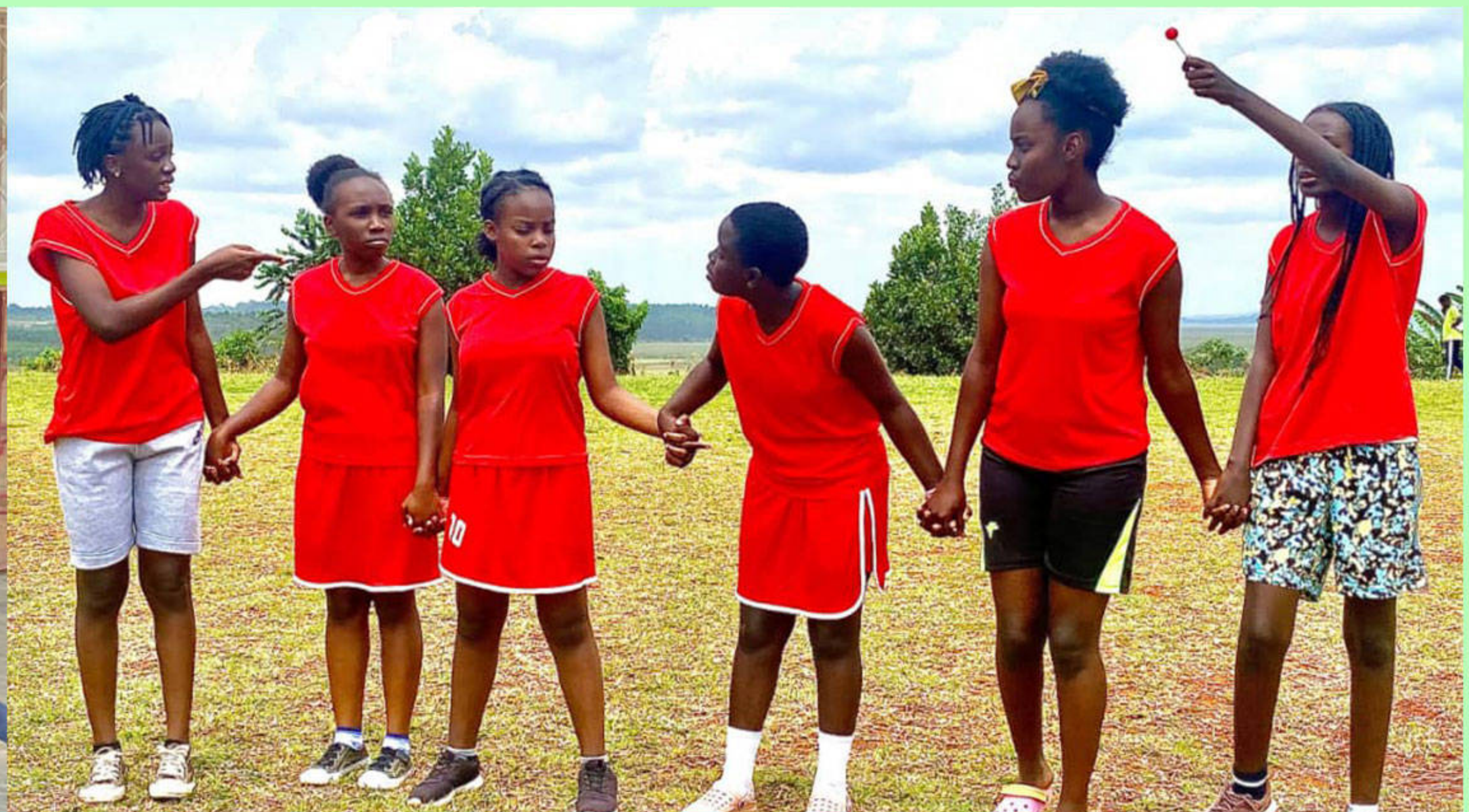
Sports Day at Kasanje Campus