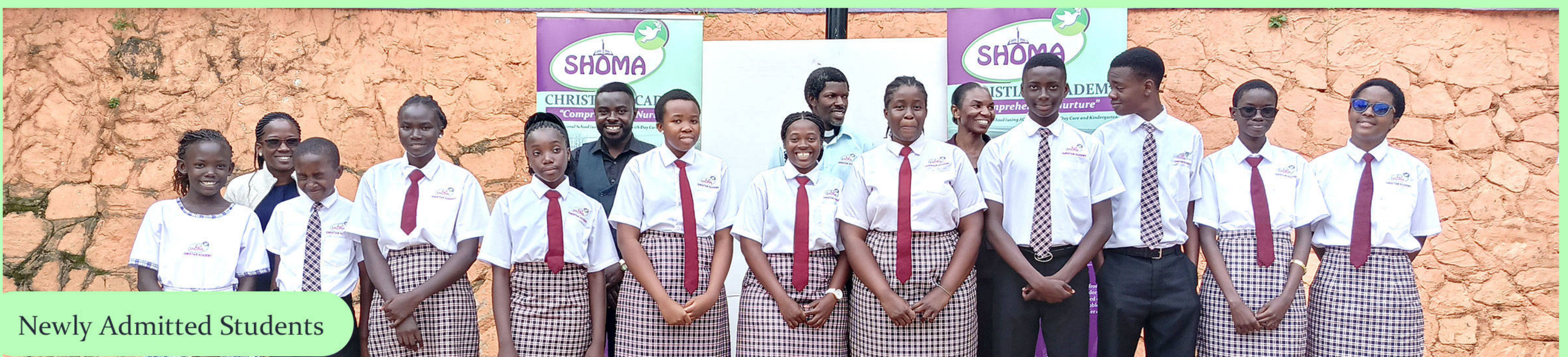
Newly Admitted Students