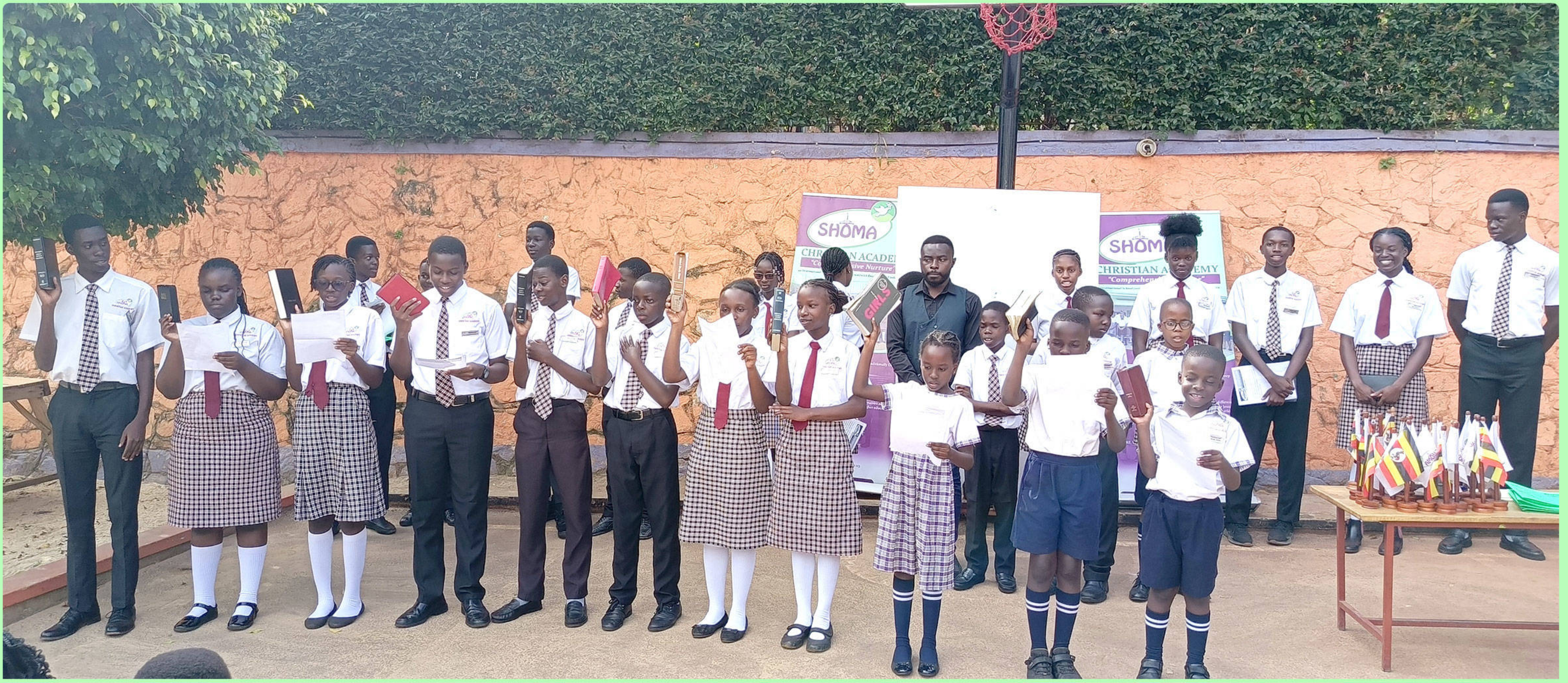
New Prefects Swearing In