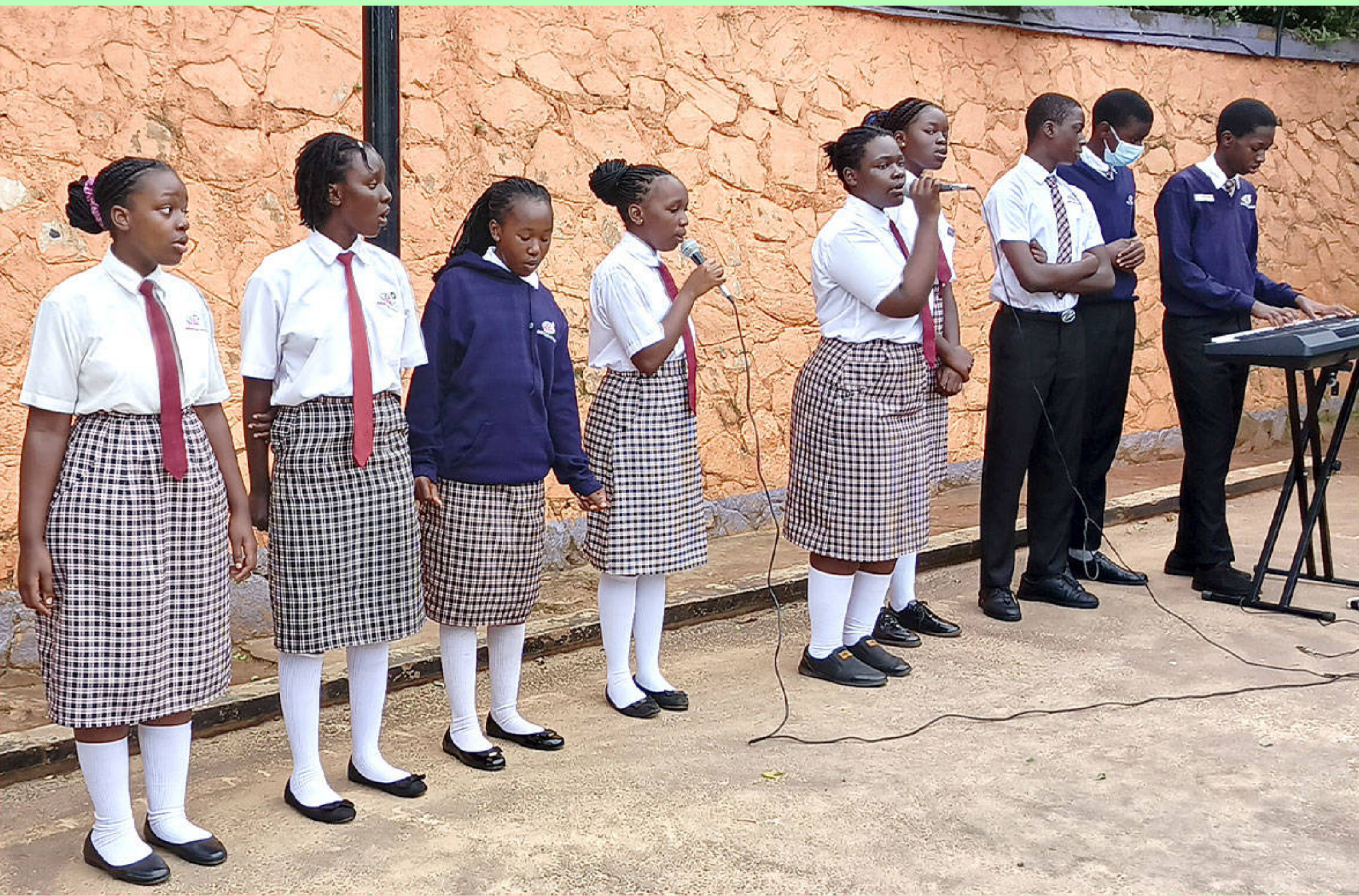
General Devotion at Ntinda Campus