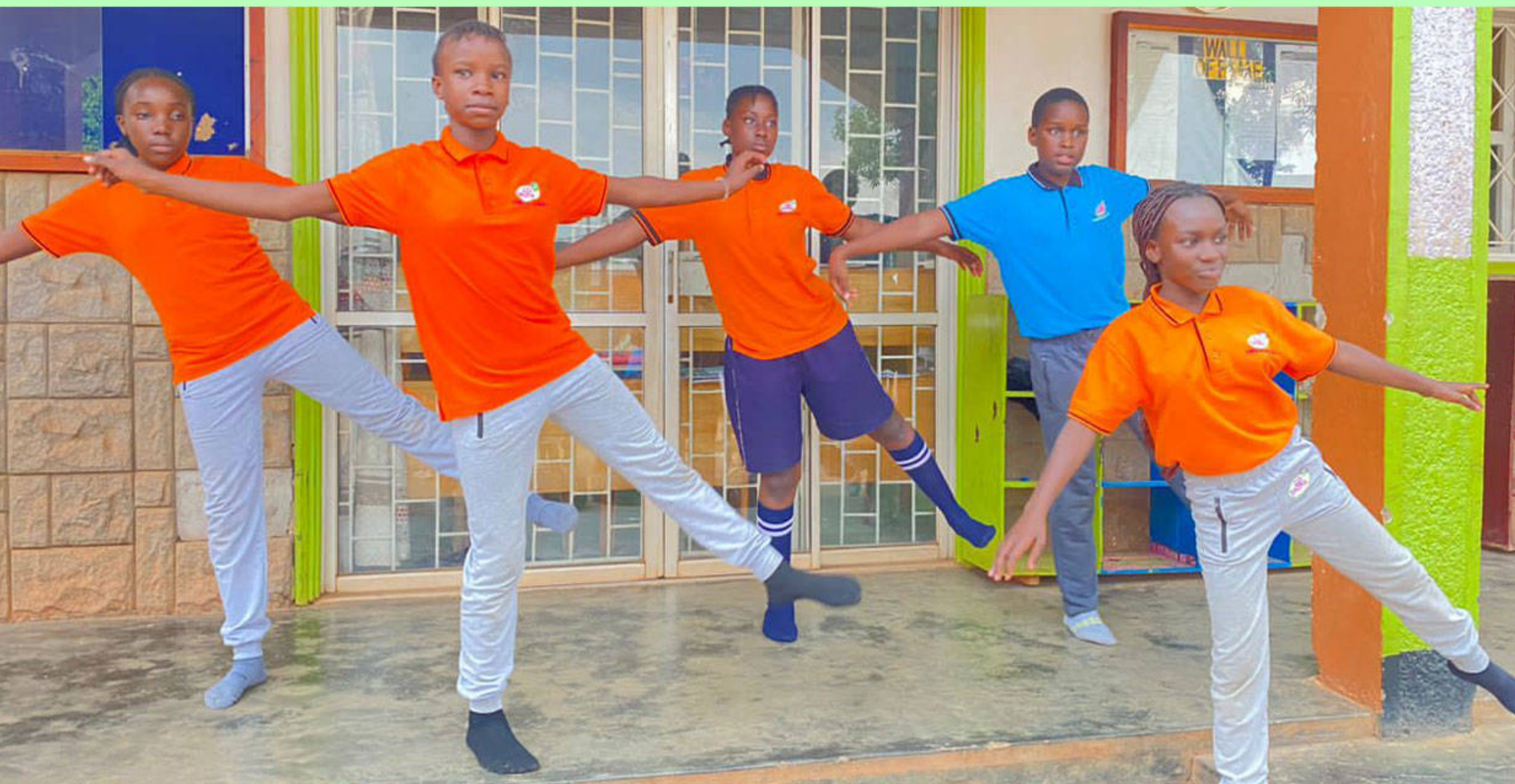
2025 Convention Practice