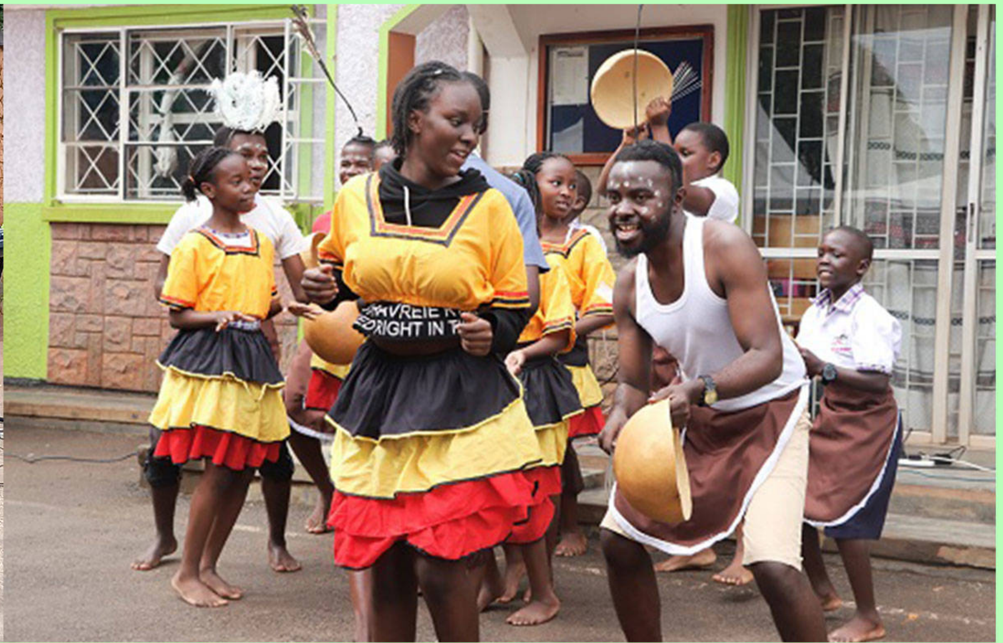
Students dancing Laraka-raka during Parents Fellowship